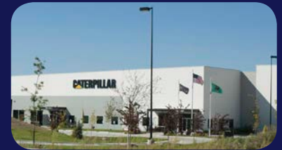
Caterpillar plant near I-90 Exit 272

Planned for construction near Exit 272 on I-90, the new West Plains Transit Center will be a major regional improvement to the transit system. Streamlined transfers between Medical Lake, Airway Heights and Cheney would improve transit for thousands of students, employees and residents.