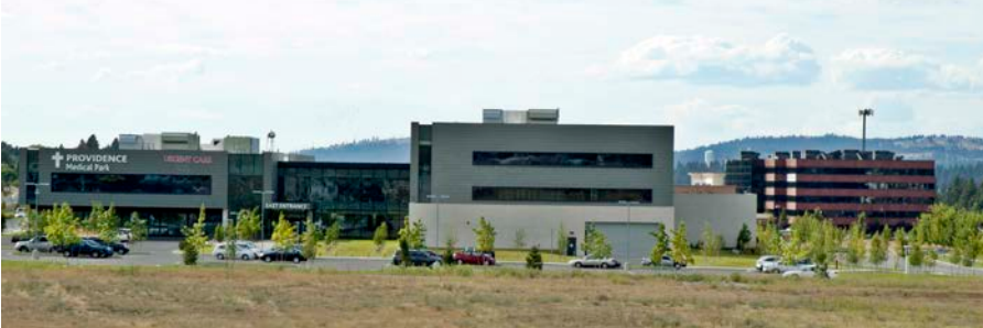
New Development in Spokane Valley

New apartment, office and medical developments along Indiana, east of Sullivan Road, would see new service as a result of numerous requests from Valley residents and employees. Adding this service will allow existing routes to provide more and better service to the area southwest of Liberty Lake.