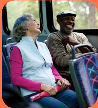
Passengers on an STA bus

STA will provide over 11 million rides this year throughout the Spokane region in a tax district called the Spokane Public Transportation Benefit Area (PTBA). Over 405,000 people live within the PTBA and 96% of all jobs within Spokane County are within the district.