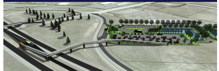
Rendering is for illustrative purposes only

The West Plains Transit Center will be designed to accommodate HPT vehicles.