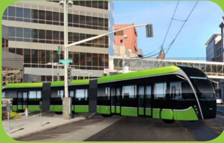
Modern Electric Trolley Bus

The centerpiece of the future High Performance Transit Network is the Central City Line (CCL). Moving people through downtown, from historic