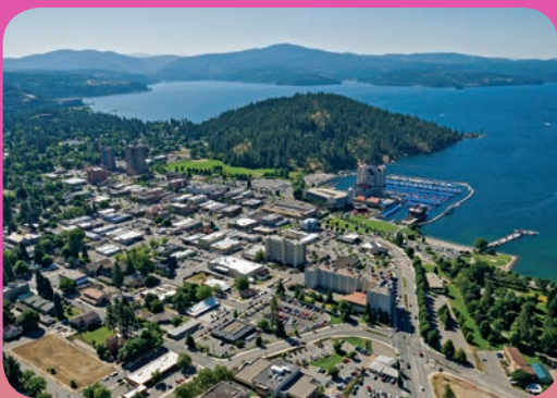
Downtown Coeur d'Alene, ID

The creation of an express transit service to downtown Spokane would provide all-day freeway service between Liberty Lake, the City of Spokane Valley and downtown Spokane. For one of the most requested service additions in the Spokane region, the line would serve an improved Mirabeau Transit Center and an expanded/relocated Liberty Lake Park & Ride.