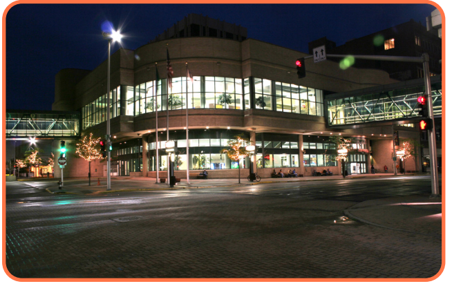
STA Plaza at night

To meet Connect Spokane policy FR3.1, existing Route 28 requires service that lasts until 10pm on Saturdays and 9pm on Sundays. More than 9,700 people within 1/4 mile of this route have regular bus service on weekdays but do not have adequate weekend service.