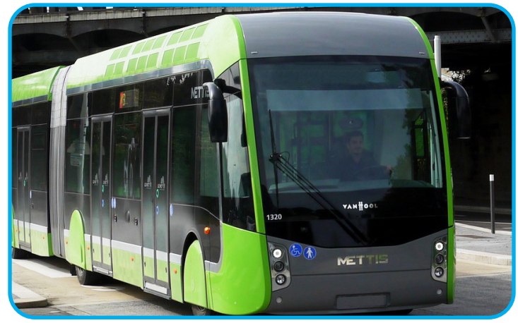
Modern Electric Trolley (MET) (illustrative purposes only)

The creation of the Central City line will move more people without more cars, help grow the Central City economy and optimize financial investments in Central City infrastructure. Running from Browne's Addition through Downtown Spokane and Gonzaga University to Spokane Community College, the Central City line will provide frequent service, expand the hours of service, provide improved passenger amenities and operate with electrically powered buses. This line will allow more transit options throughout the region for people who don't need to travel through downtown to reach their destination. Additionally, the Central City Line will change transit